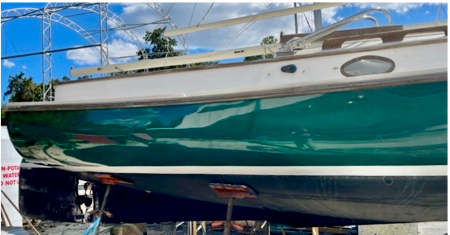
2017 / MARSHALL 22 / FITZ