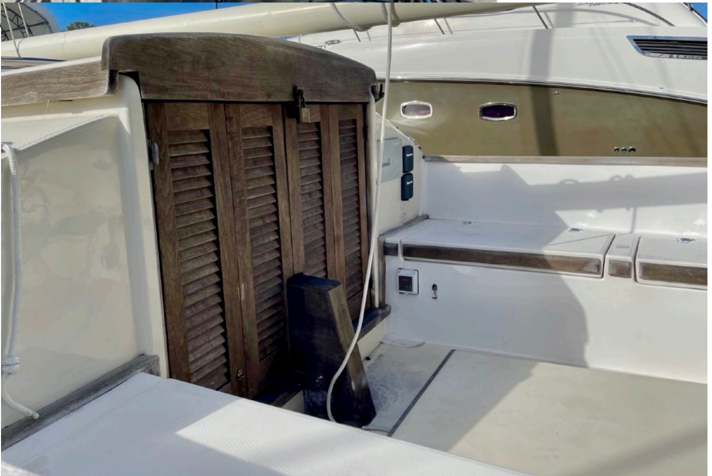
2017 / MARSHALL 22 / FITZ