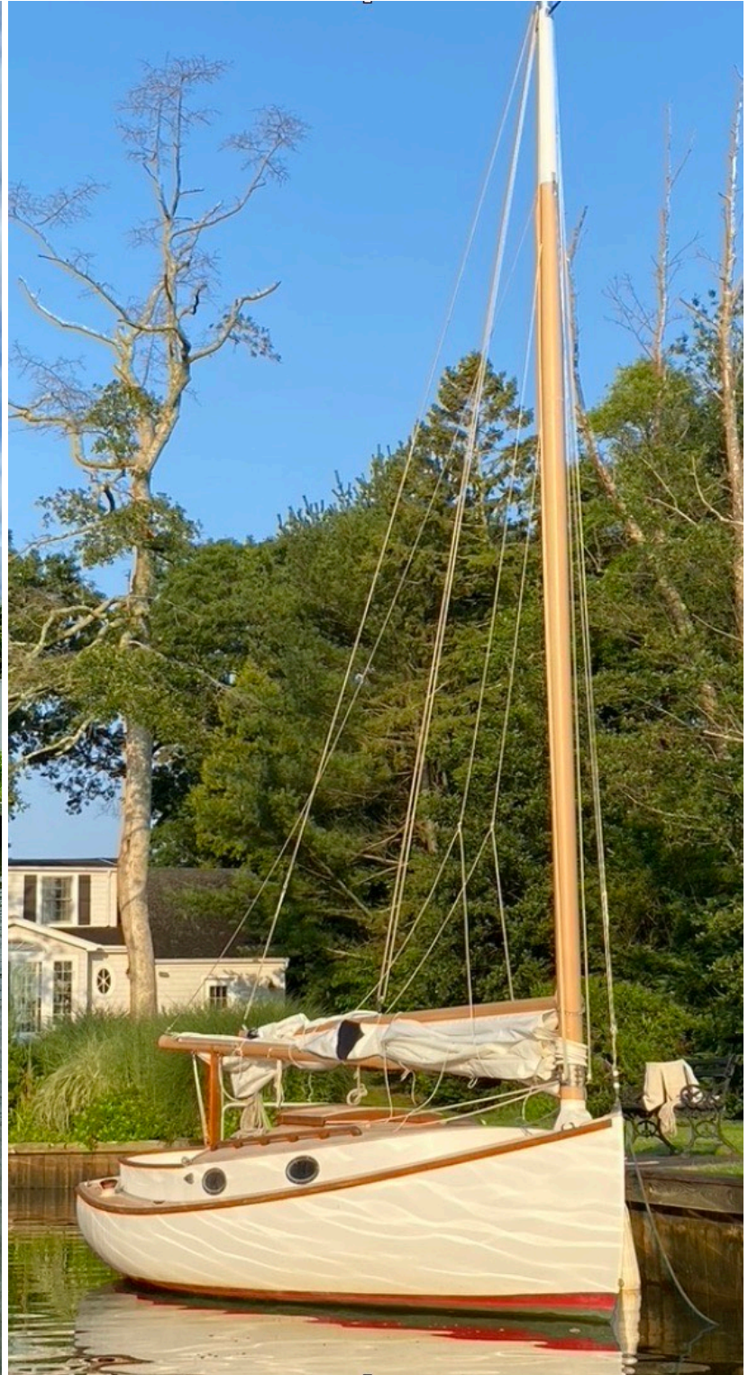
1986 / MARSHALL SANDERLING / RUDDY DUCK