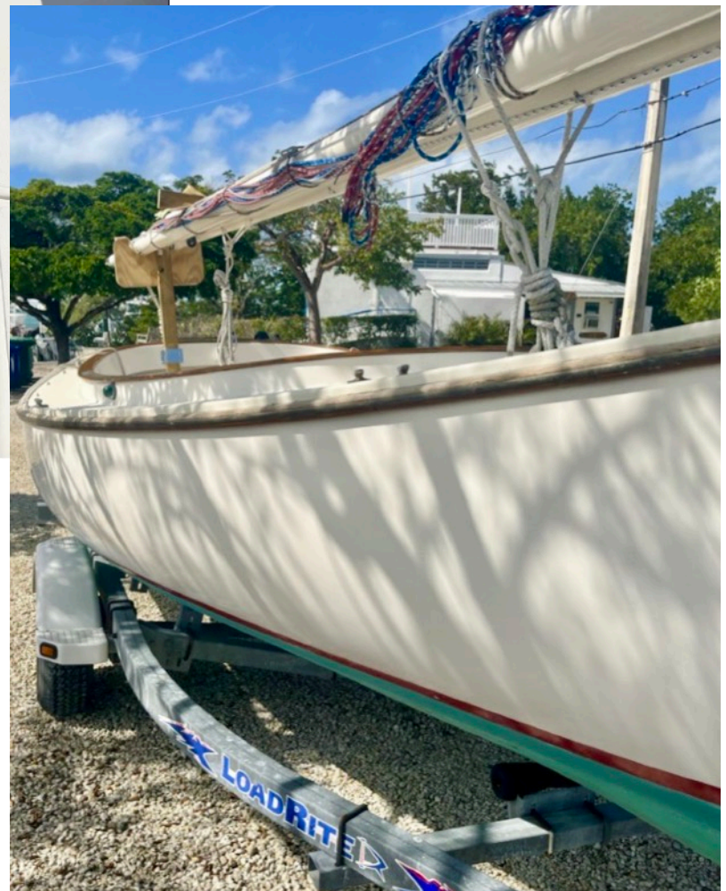
2003 / MARSHALL SANDERLING (OPEN) / MARY OF KEY WEST